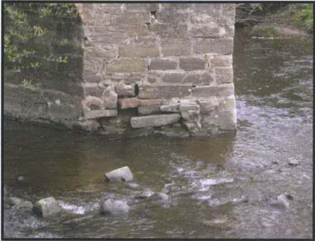
Photo 1. Missing Masonry / Damage at Upstream LHS of Cutwater.