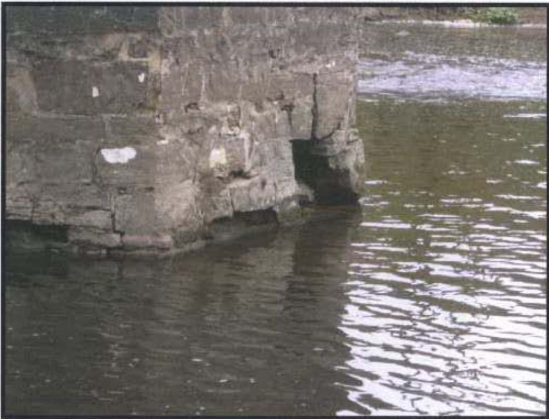
Photo 2. Missing Masonry / Damage at Downstream RHS of Cutwater.