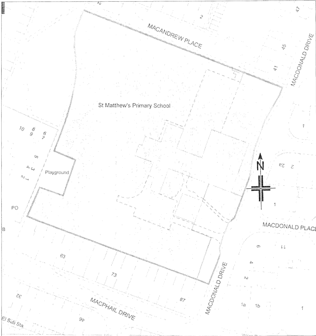
LOCATION PLAN (SCALE 1:1250)